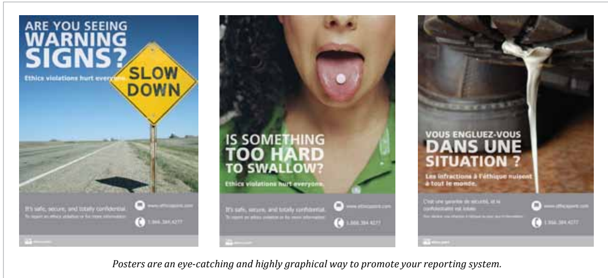
Posters are an eye-catching and highly graphical way to promote your reporting system.