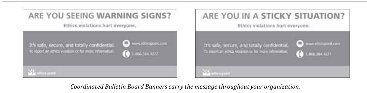
Coordinated Bulletin Board Banners carry the message throughout your organization.